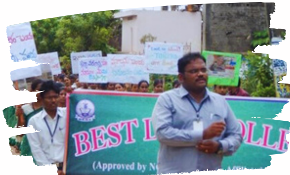
Community Development Program