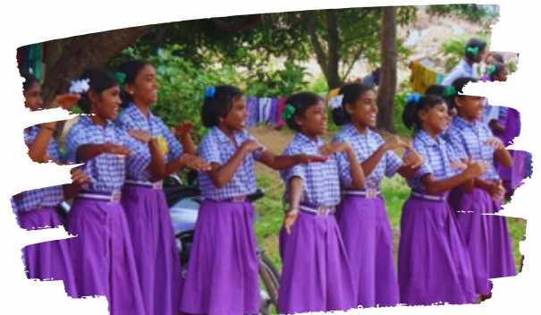
Motivational program for adolescent girls