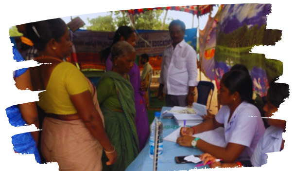
Care For the Aged, medical treatment program.