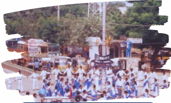
Non Violence Day