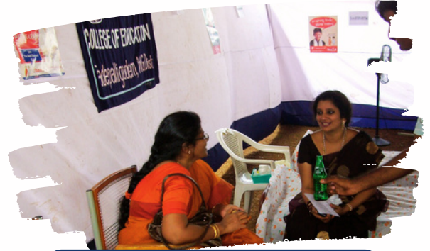
Blood Donation by Chairperson