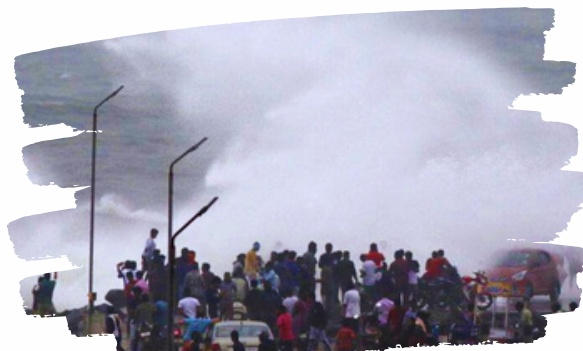
Disaster Management Relief Program at Katrenikona Village of Konasaseema Village